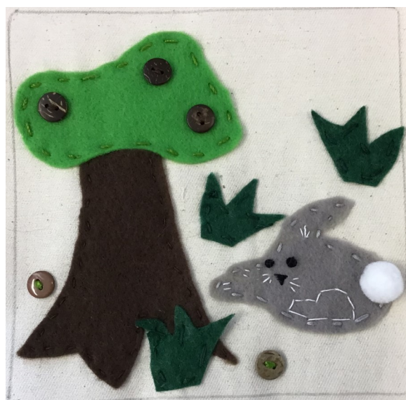
Evie loves the rabbits that visit our school field overnight and are often still out having their breakfast when we arrive in the morning.